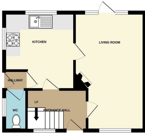
GROUND FLOOR 367 sq.ft. (34.1 sq.m.) approx.